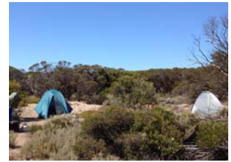
Field camp site at Seagull Lake

Mind you, the deep sand had its own interesting denizens. When we packed up the expedition we found that a very large Urodacus novaehollandiae , or sand scorpion, had made its home under Brian Timms’ tent! It was more than 10cm long, and quite the most handsome beast.