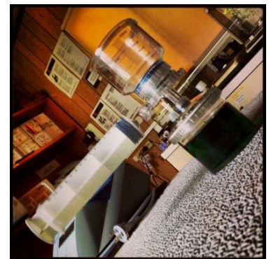
Field filtration kit for chlorophyll

And, as I said last year, we have our novice Facebook page up and running. Let me know if there is anything you would like to see on the page. We also have albums of photos linked to the page, including field trip photographs, samphire species photos, the flora of the delta of the Ai Sissa in Flores, diatoms from the Onkaparinga. Log in and leave a comment!