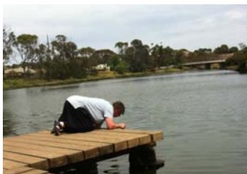
Collecting water samples during regular fortnightly monitoring

A set of differential interference contrast microscope photographs of all the species encountered was provided to the Adelaide and Mount Lofty Ranges NRM Board to form the basis of a diatom herbarium for the estuary, and a subset of the photographs (including the most beautiful ones!) can be viewed on our Facebook page, as an album.