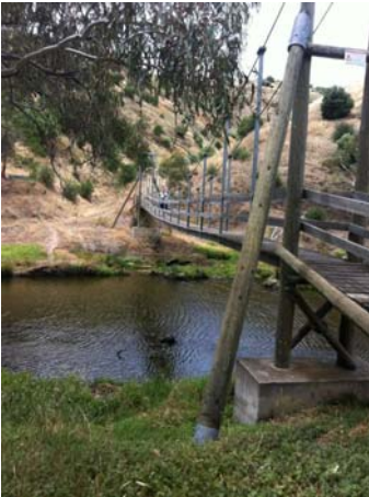
Old Noarlunga sampling site

In 2012 the AMLR NRM Board implemented increased environmental flows in several South Australian rivers. The Onkaparinga was one of these. The additional water allowed the river to develop a positive salinity gradient that was retained over the entire autumn-winter-spring period for the first time in many years. Ammonium concentrations in the river reduced, a fresh cohort of samphires sprouted along the shore, and Delta undertook a survey of diatoms along the estuary. Thomas had undertaken a survey in the mid to late 1970s, when the river had reasonable environmental flows. Many of the species he recorded had not been visible in regular water samples collected in the past few years.