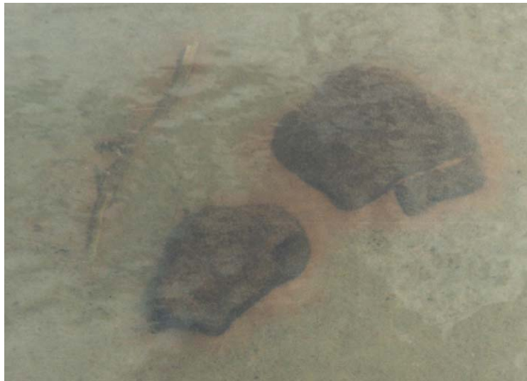
Figure 7 - Clay released from benthic mat surrounds a "grazed" rock

The cyanobacteria found in benthic mats may cause a rise in the viscosity of the brines overlying them. This normally occurs when the cyanobacteria in the mat become nutrient stressed. Roux (1996) found that when nutrient supplies dropped rapidly the cyanobacteria