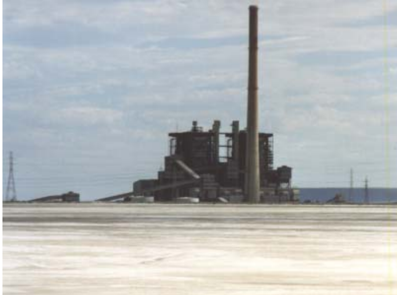
Figure 2 - Flyash playa

discharge from the power station discharge gate. The discharge is the source water for Bird Lake and it would appear likely that the phosphate is sourced in the flyash of the playa (Figure 2). An analysis of the flyash was conducted for Optima Energy by CSIRO's Lucas Heights Centre for Advanced Analytical Chemistry in 1993. It confirmed that flyash contains about 0.3% phosphorus.