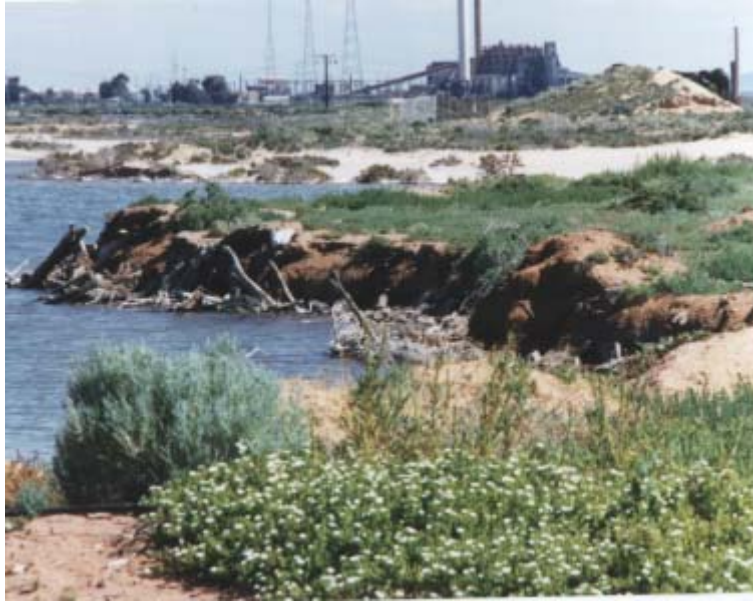
Figure 6 - Eroded northern banks

In the northern areas of the lake there are some eroded banks edging the water (Figure 6). The fine clay particles are washed into the brine and become incorporated into the benthic mat. Where the mat is growing over the surface of rocks Artemia find it easy to attach themselves to feed. Surrounding these rocks is a distinct orange halo (Figure 7) where the clay has been released, either during the “brushing” process of grazing or later from the faecal materials deposited by the shrimp.