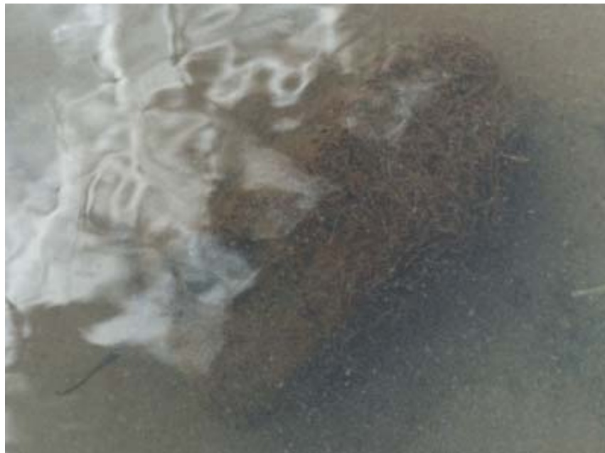
Figure 5 - Artemia feeding on the benthic mat where it coats a rock

The mechanism Artemia franciscana uses to feed from the benthic mat appears to be the same as that used by Artemia parthenogenetica . That is, the animals roll over so their ventral surface faces the benthic mat and the phyllopods of the animals continue to beat although all forward motion is ceased. The phyllopods brush the mat, releasing diatoms and cyanobacterial cells to be ingested by the shrimp.