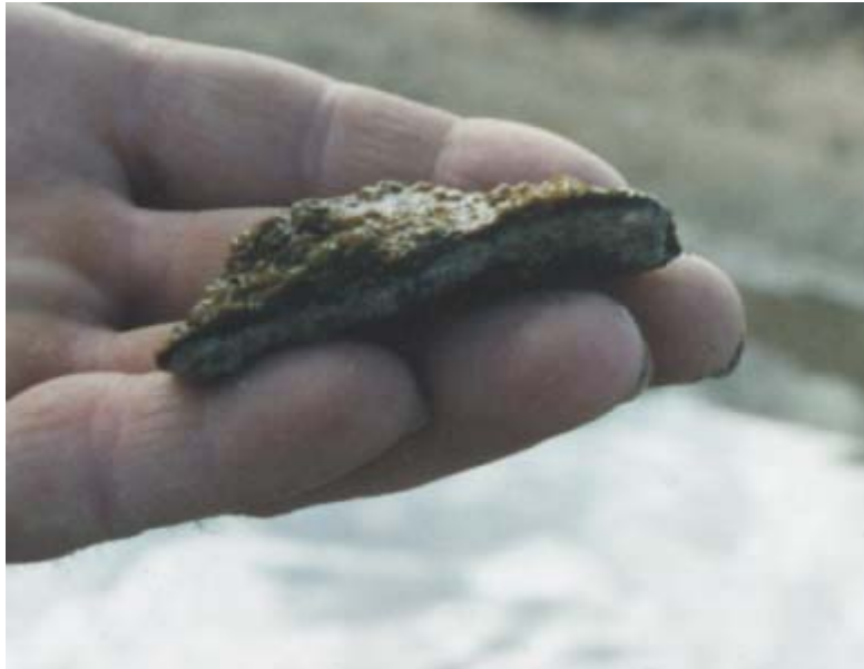
Figure 3 - Layered benthic mat from the floor of Bird Lake

A feature immediately observable during the site visit was the almost continuous benthic mat growing across the lake floor (Figure 3).