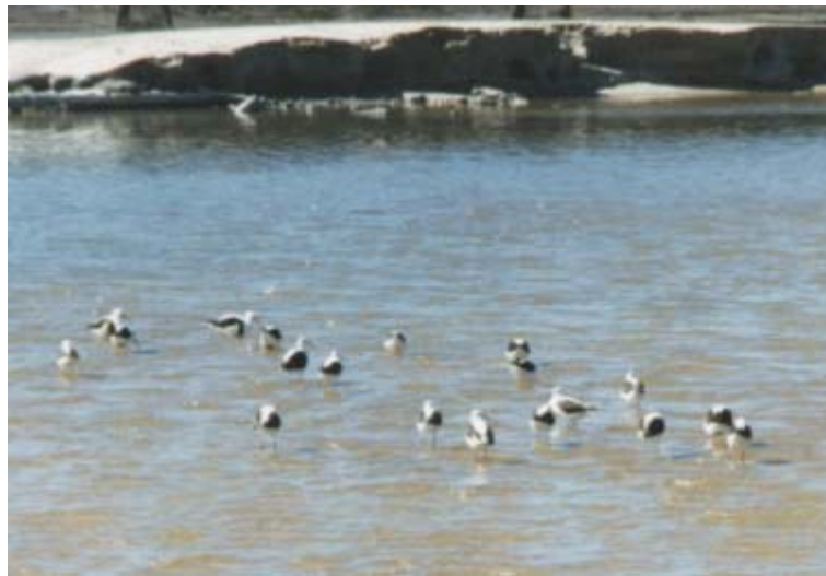
Figure 8 - Shorebirds feeding on Artemia

The Artemia in Bird Lake are the food source for many of the protected shorebirds that visit the lake (Figure 8). The shrimp are the route by which phosphates leave the lake. Ideally the shrimp should be able to feed on plankton, rather than on the benthic mat. It is possible that by gradually increasing the availability of oxidised nitrogen and silica, planktonic diatoms may be able to become the dominant algal group in the lake (Ghassemzadeh, 1997). Diatoms do not produce mucilage and are a more valuable food than cyanobacteria for Artemia . Any such attempt to change species dominance would need to be undertaken with caution as rapid changes in the availability of nutrients could cause a massive increase in viscosity (and foaming) of the lake waters.