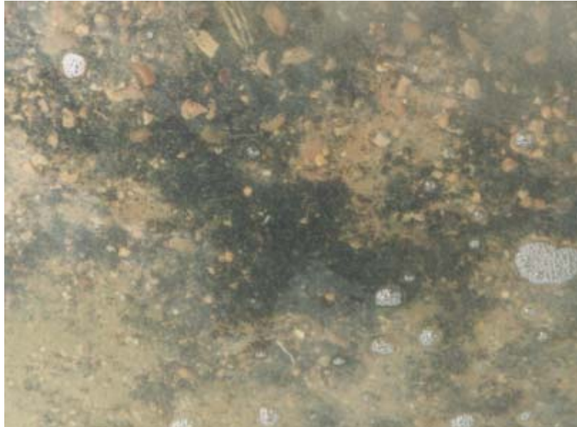
Figure 9 - Floating globular colonies of cyanobacteria

floating globular colonies (Figure 9). These globules are abraded by the action of the water and the coarser particles of flyash/coke, releasing mucilage.