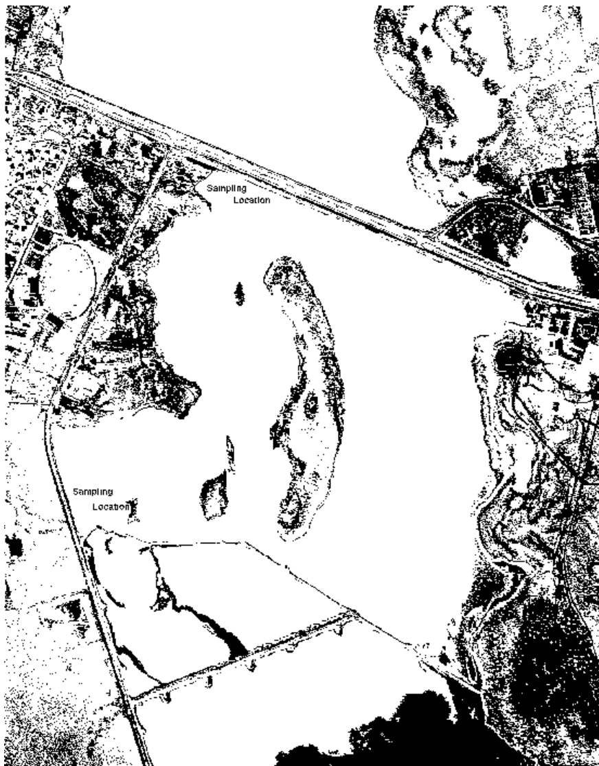
Figure 1 - Bird Lake sampling locations

A water quality monitoring program was established at Bird Lake in late 1997. The program included bimonthly sampling and some data logging. Parameters included pH, conductivity and specific gravity, turbidity, dissolved oxygen, temperature, floccable organics, oxidised nitrogen, total and dissolved orthophosphates and viscosity. Data logging was conducted for temperature. Plankton were classified and counted to gain a picture of the main species and densities present. Samples were collected at the northern jetty and at the southern discharge as shown below in Figure 1.